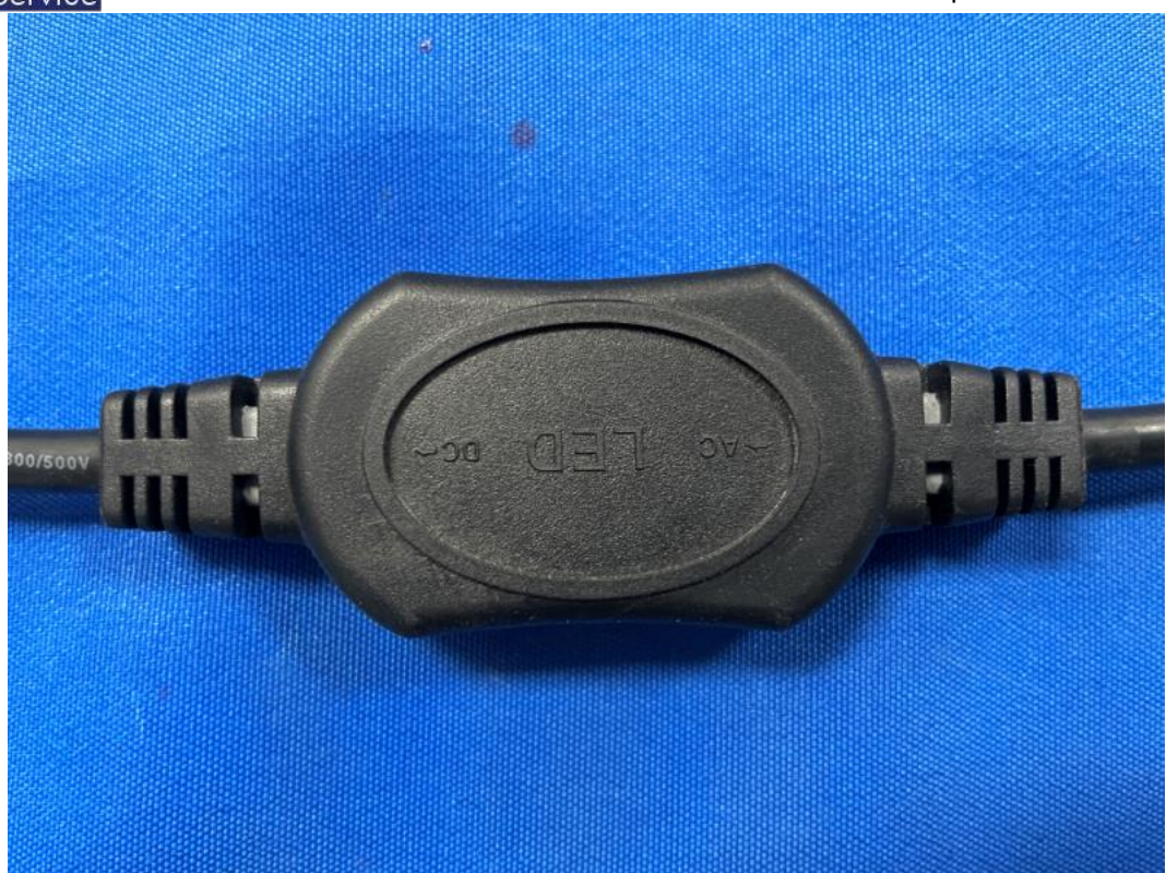
Fig. 3: Overview