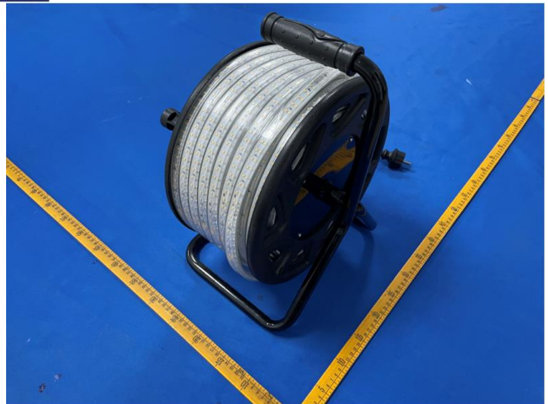
Fig. 1: Overview