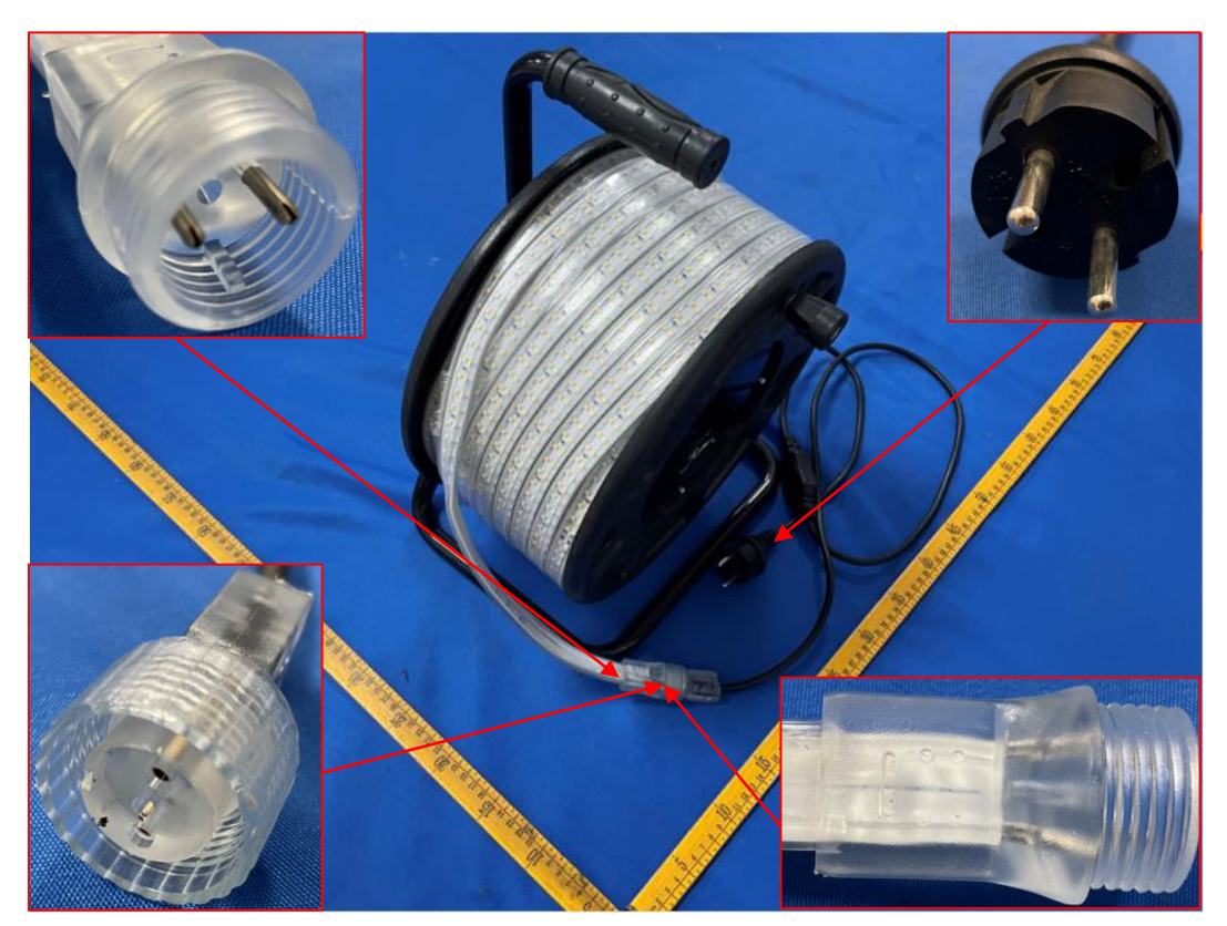
Fig. 2: Overview