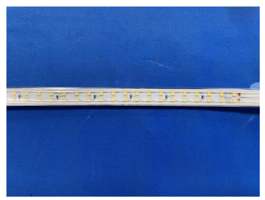
Fig. 4: LED module